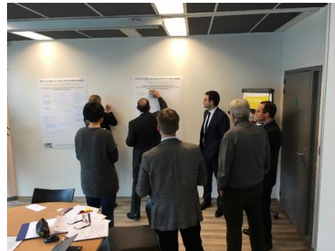
Overview of the poster session methodology (left picture) and poster session (right picture).